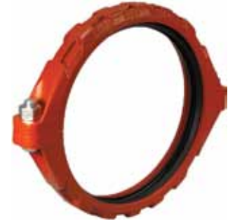
14 – 24”/350 – 600 MM SIZES